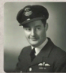
Jan 24, 1921- May 18, 2015