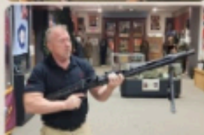
We accept all donated militaria